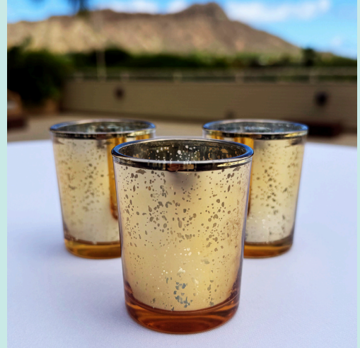
Gold Candle Votive including LED $1.50 each *Up to 39 available*