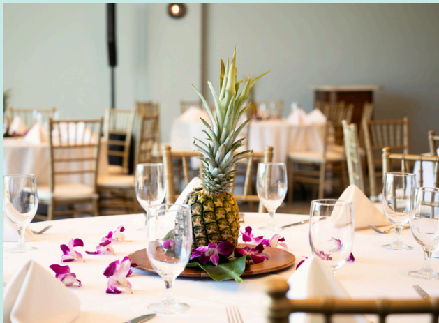
Tropical Centerpiece Pineapples, Scattered purple orchids, Ti leaf $25 per table