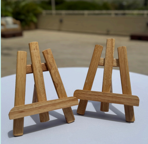
Small Wooden Easel $5 each *Up to 4