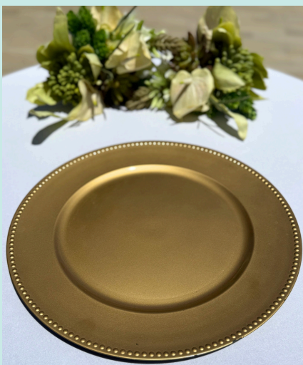
Gold $5 each Up to 50