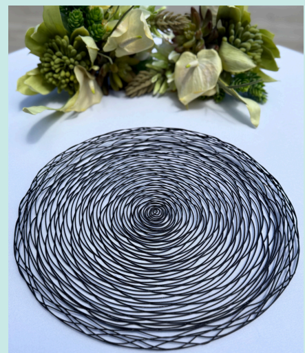
Black Weaved Wire Charger $5 each Up to 19